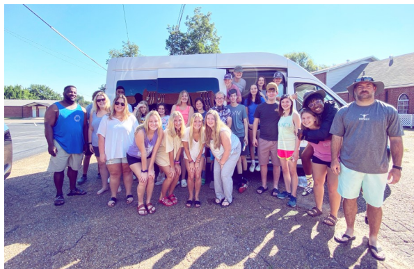
Canoe Trip June 17, 2020

Hello everyone! Summer for youth is in full swing. We have had a lot of fun in the midst of ever-changing times. I am looking forward to what's to come as we are already halfway through the summer. The biggest of those being Camp! We are actually putting on our own camp at the beach! There are a couple ways we need your help first being prayer. I believe this will be a mile marker for each of our students' lives. So I ask you: pray!! We will be creating prayer cards that you can grab and pray for a student as they attend camp. The second thing I ask: give! Many students and parents have been effected by the fluctuation in work, so I ask that if you can give, please do. We want no excuse for a student not to go and hear from the Lord. We can't wait for camp as it will be the launch pad for our students as we go back to school. Church, again, thank you for being such a supportive and loving people to our students. Below you will see a list of food items you can donate to help us as we go to camp: