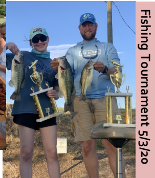
Fishing Tournament 5/3/20

We are geared up and ready for an awesome summer. We have a lot of fun events planned as well as some new ways we will gather to study God's word. This summer we will be focusing on Growth in our walk with the Lord as well as how it transitions into our everyday life. I pray that this summer will be a time of revitalization in your spiritual life and growth in your bonds with others.