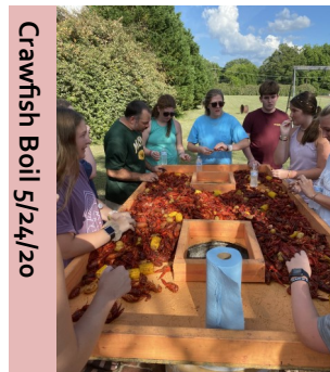
Crawfish Boil 5/24/20